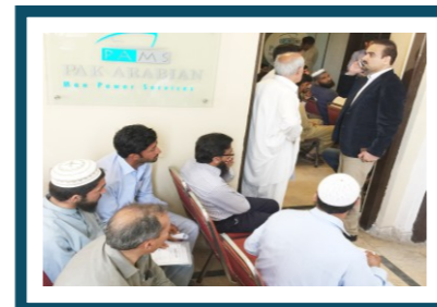
Elkhereiji Conducting Interviews