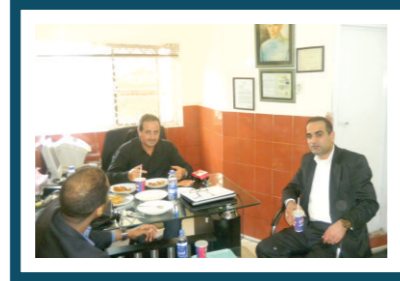
IBS Delegation Conducting Interviews