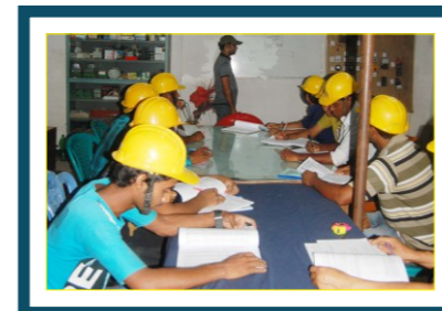
Engineers Test at trade center