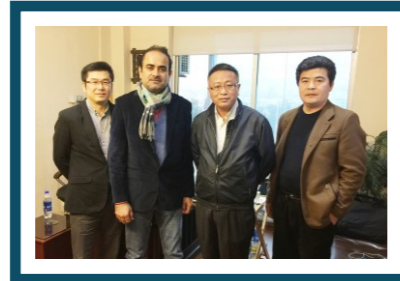
Jinangsu Jingtian Building Construction UAE & Saudi Arabia