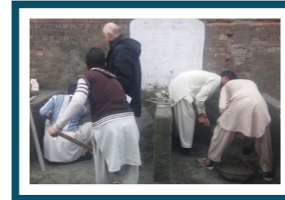
During Test at Trade Center