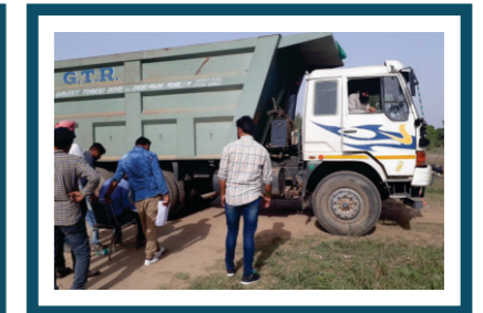
Delta Delegation Conducting Tests