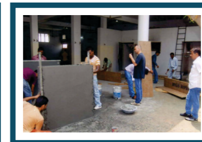
Station Constructing Co. Jeddah