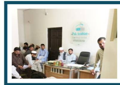
Al-Ziady Delegation Conducting Interviews