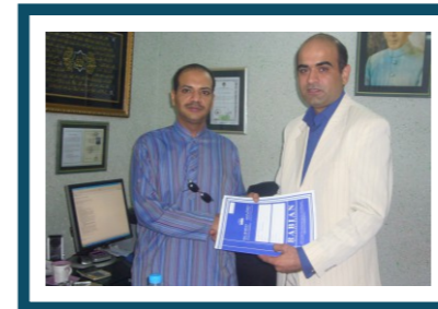
CEO with Director HR Movenpick Madina