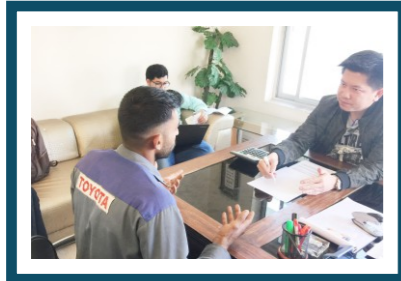
Al Nahdi Al-Sakhaa Delegation