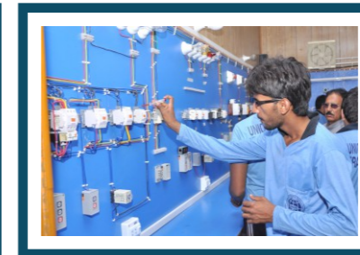
Azmeel Delegation Conducting Tests