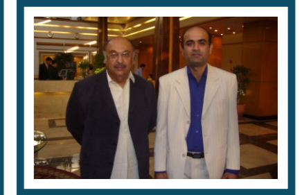
CEO with Chief Minister Balochistan