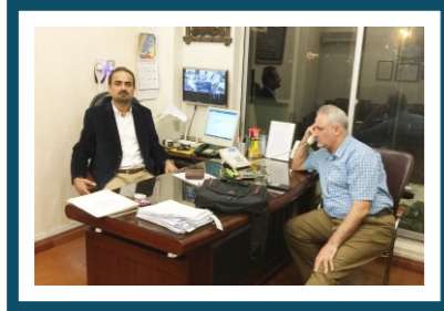
CEO with Riyadh Ceramics Delegation