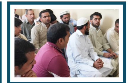
Azmeel Construction Co. Interviews