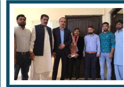
CEO with Pak Arabian Staff