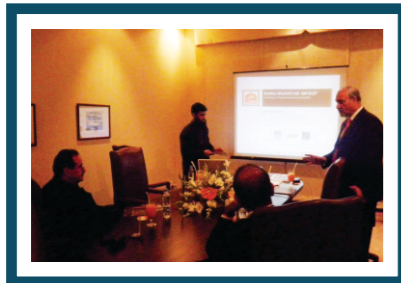
IBS Delegation During Briefing