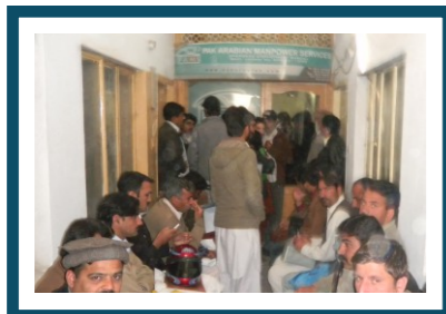
Taiba Agriculture & Development Interviews